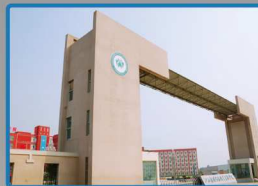
Networked Security: School