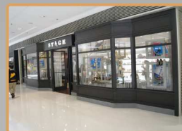
Standalone Access control: Shop