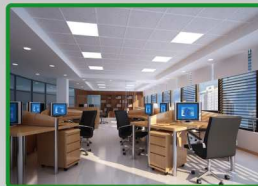
Time Attendance: Office