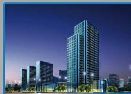
Networked Security: Building