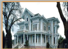
Standalone Access control: House