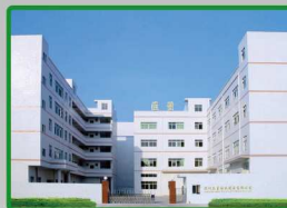
Time Attendance: Factory